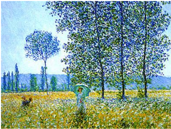
Champs au printemps (C. Monet - 19 ème siècle)