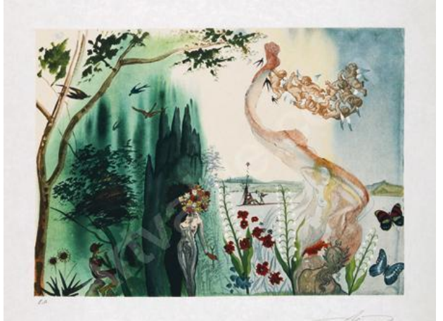
Le printemps (S. Dali - 20 ème siècle)