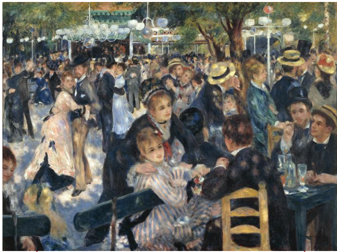
Bal du Moulin de la Galette (A. Renoir - 19 ème siècle)