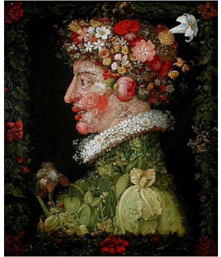
Le printemps (Arcimboldo - 16 ème )